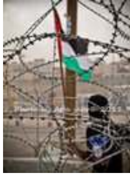
Palestinians still live in concentration camps today

Join WIVL to fight for the implementation of the programme of the Fourth International today. Forward to the refounding of the Fourth International; forward to Socialism.