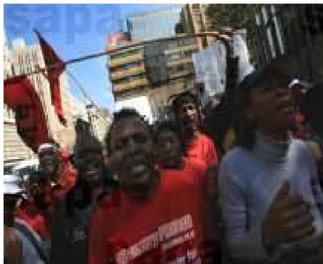
Alexandra residents on the march for houses for all