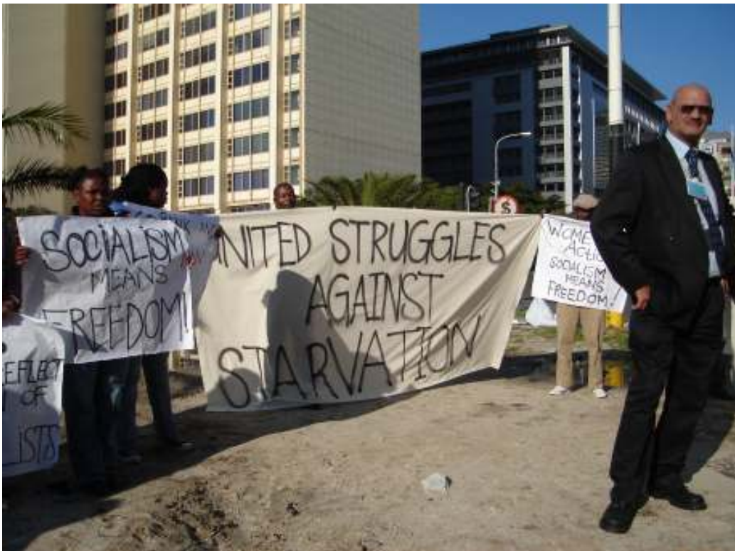
United Struggles Against Starvation pickets at World Economic Forum

Qaphela: Esi sisiqendu sokuqala sesivumelwano phakathi kweWIVL ne FLT. Isiqendu sesibini kunye nemiba esingavumelani ngayo yaye esephantsi kwengxoxo silandela kwiphepha elilandelayo.