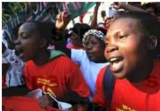
Residents of Alexandra on the march for houses for all