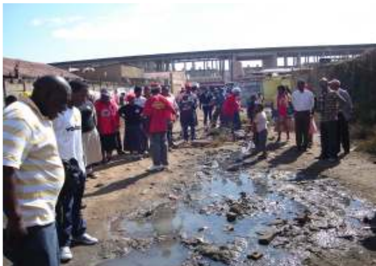
Raw sewage in Kliptown (birthplace of the Freedom Charter) in 2008.