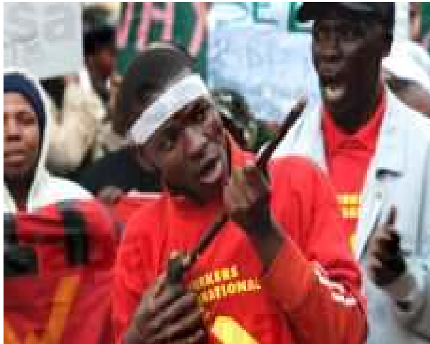
Alexandra residents and supporters from WIVL on the march for housing for all