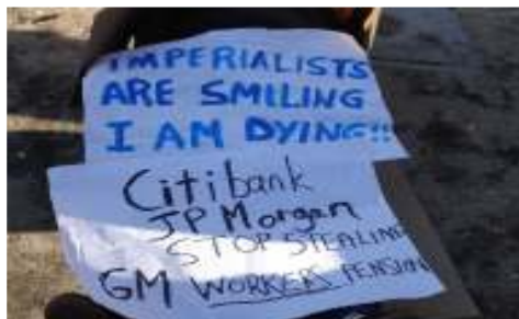
USAS Protest at World Economic Forum (Africa) 10 June 2009