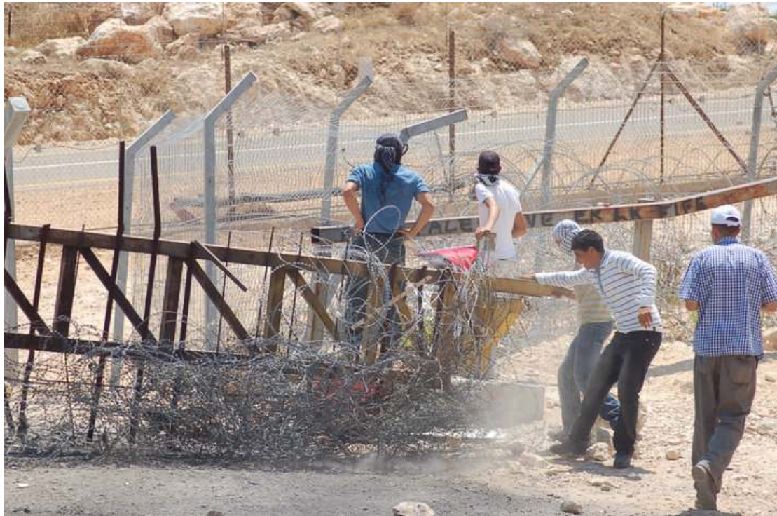
Workers, peasants of the Popular committees against the wall, 5 years' protest

Tear down the Rafah border, down with all the walls and checkpoints !